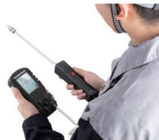
external pump gas detector

ООО «ТИ-СИСТЕМС» ИНЖИНИРИНГ И ПОСТАВКА ТЕХНОЛОГИЧЕСКОГО ОБОРУДОВАНИЯ